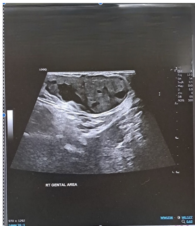
Figure 2: The ultrasound shows the hydrocele of Nuck's canal. The arrow illustrates a comma-shaped hydrocele attenuated by the fluid.