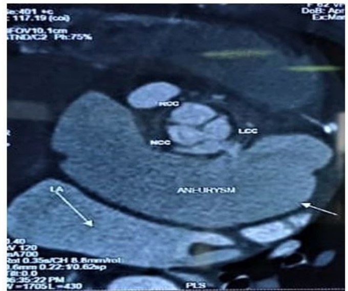
Figure 1: CT angiography image- a large aneurysm arising from the non-coronary cusp and compressing the left atrium(LA)