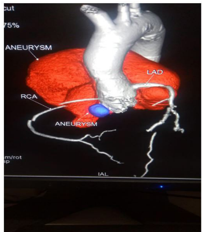
Figure 2: 3D reconstruction image- the aneurysm is seen compressing the right coronary artery(RCA) and left anterior descending artery(LAD)