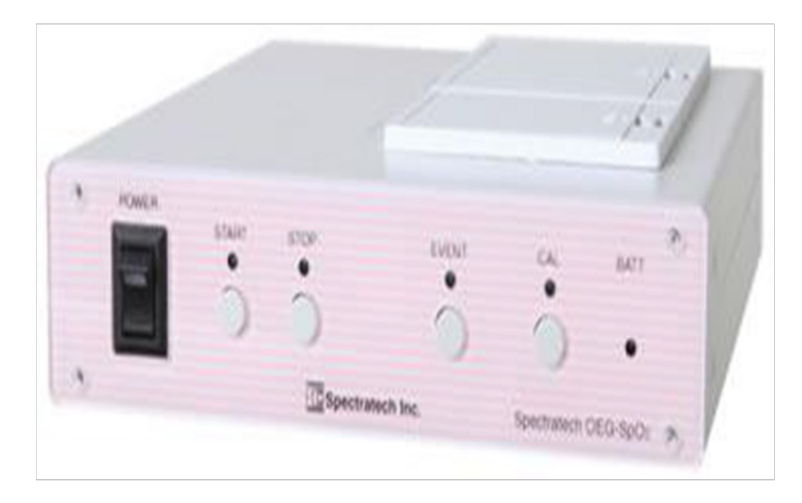
Figure 2: 16-channel optical encephalography using the OEG-APD series instrument developed for encephalography

Figure 1 -flow of the blood at the frontal part of the brain was measured using 16-channel optical encephalography using the OEG-APD series instrument developed for encephalography