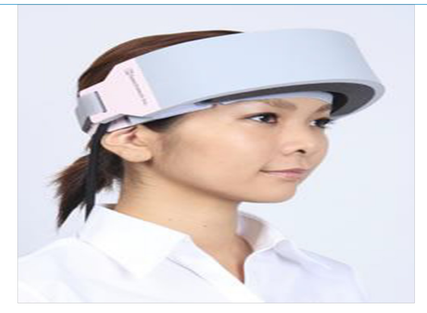
Figure 1 -flow of the blood at the frontal part of the brain was measured using 16-channel optical encephalography using the OEG-APD series instrument developed for encephalography