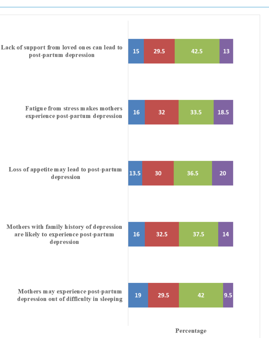
Figure 3: Risk Factors for Post-Partum Depression among respondents