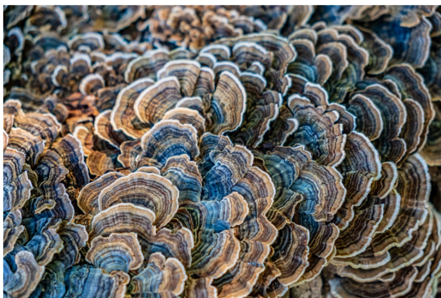
Figure 2: Turkey tail commonly fruits in overlapping shelves on hardwood logs and stumps.

The mushroom lacks a true stalk or has only a very short attachment point. The undersurface contains tiny pores that range from white to pale brown. Unlike some similar species, the pore surface does not stain when bruised. Young specimens are flexible and leathery, while older specimens become hard, rigid, and woody.