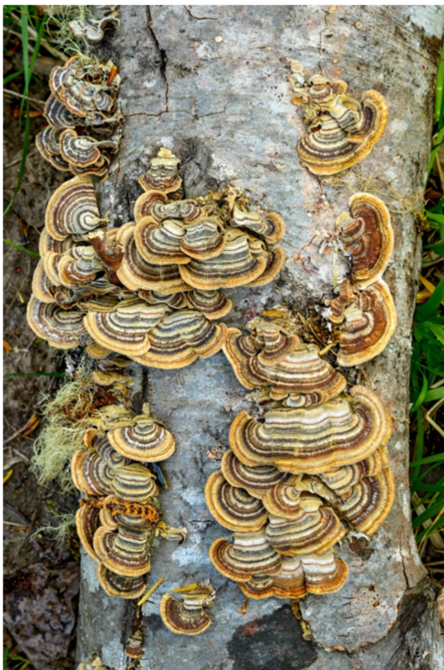
Figure 3: Turkey tail ( Trametes versicolor ) mushroom growing on a hardwood log.

rope, Asia, South America, and many other temperate and subtropical regions.