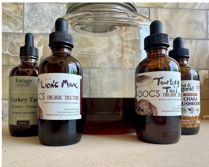
Figure 5: Turkey tail tinctures are widely available commercially or can be made yourself using a simple recipe.

Turkey tail extracts are widely available as bulk powders, capsules, tablets, and tinctures. Products may be derived from either fruiting bodies or cultured mycelium. Alcohol extracts are commonly marketed as tinctures and are available through health food stores and online retailers.