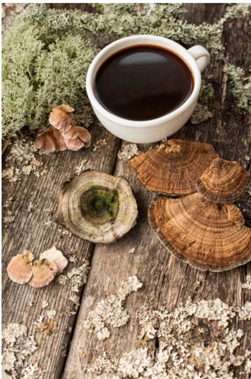
Figure 4: Turkey tail is used as an ingredient in some coffee and tea products.

Turkey tail is commonly consumed as a tea, powder, capsule, or liquid extract. Hot-water extraction and dual alcohol-water extraction methods (tinctures) are frequently used to improve the bioavailability of beneficial compounds. Turkey tail is also a common ingredient in medicinal mushroom blends, coffees, teas, and other functional food products.