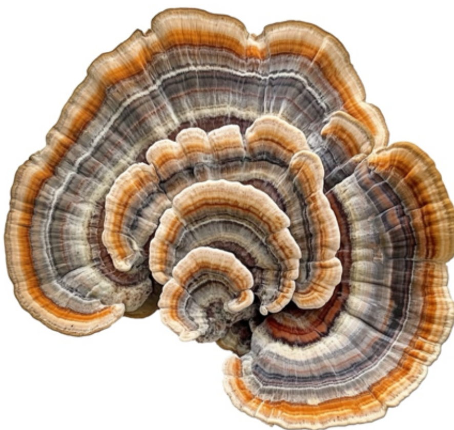
Figure 1: Turkey tail mushroom resembles the tail feathers of a wild turkey.

Medicinally speaking, however, turkey tail is certainly “no turkey.” It contains some of the most extensively studied bioactive compounds found in any medicinal mushroom. This article reviews the compounds and mechanisms that make turkey tail an important functional mushroom for promoting human health. It also discusses how to identify turkey tail in the wild and where it can be found. Because turkey tail has no known toxic look-alikes, it is considered one of the safest mushrooms for beginning foragers and a valuable addition to the medicinal mushroom cabinet [1].