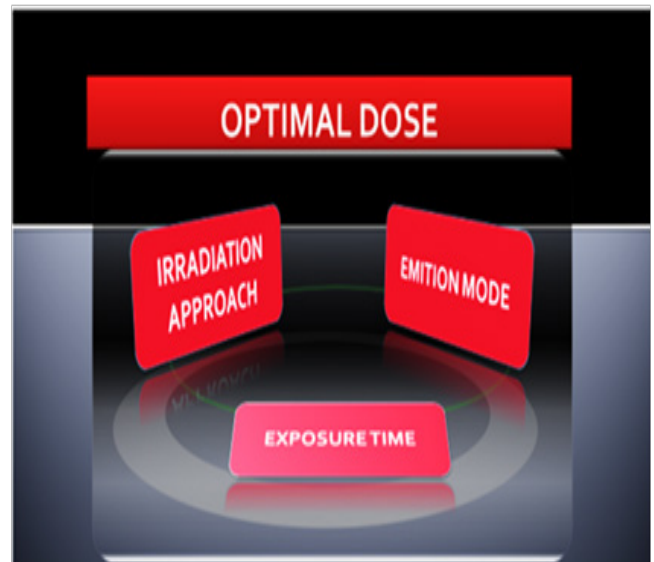
Figure.2 Schematic illustration of the methodical approach for choosing the optimal dose of laser radiation individually for each patient and for each stage of treatment

World literature provides information on scientific controversies and fluctuations at the recommended optimal dose of electromagnetic radiation on the human body [1,8]. It has been shown that tissue reactions are variable in nature under the influence of different physiological internal and external states in the dynamic self-regulating system of the human organism [3-6]. The current nature of the problem is determined by the direct relationship between therapeutic efficacy and biological factors such as total body reactivity, regenerative and reprocessing processes, oxidative and reductive potentials, regional and general blood flow, the presence of pathogenic associations of microorganisms and the neuromuscular regulation of the function [2, 7].