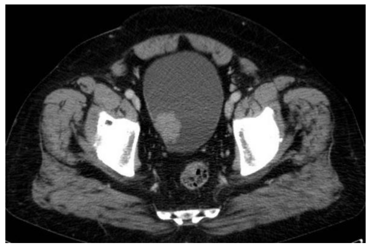
Figure 1: Transverse CT-scan image showing a 3cm mass in the posterior urinary bladder wall

During the postoperative follow-up, our patient was completely asymptomatic. It presented no more hematuria and neither high blood pressure. Post-operative MIBG was normal as well as the metanephrines.