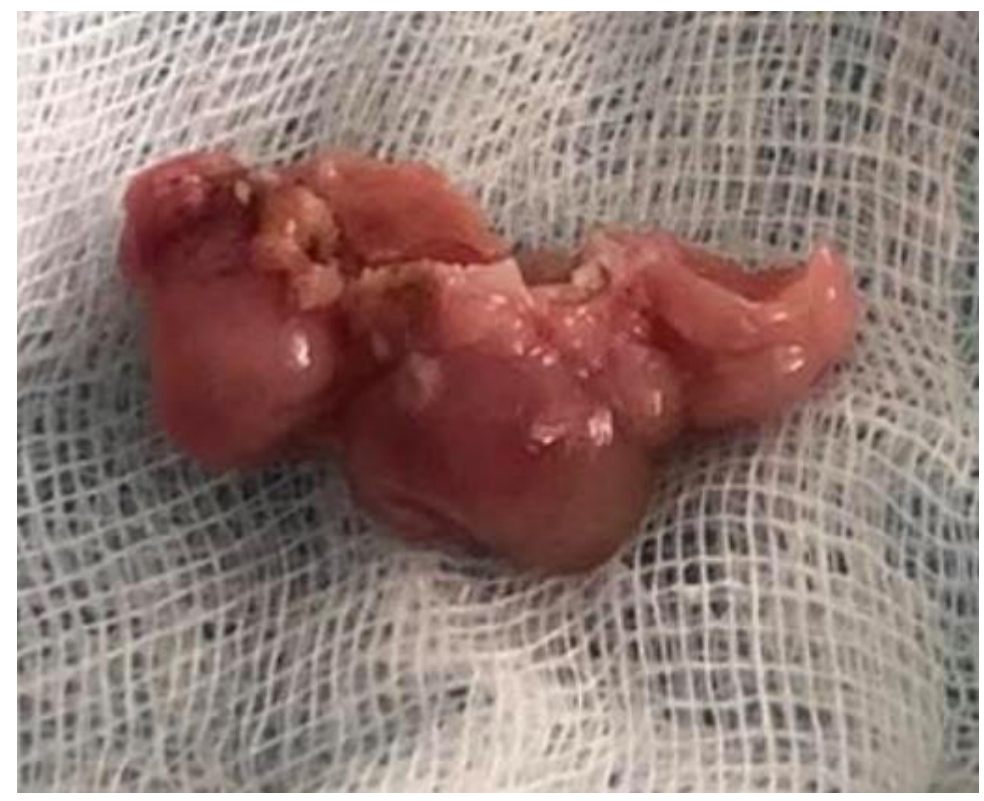
Figure 4: Macroscopic view of the resected bladder paraganglioma. the tumor is red-brown in color, lobulated and well-circumscribed